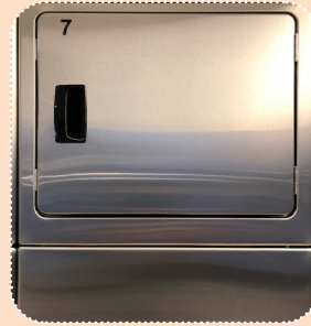
Dryer (top washers)